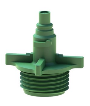
3/8" threaded nozzle