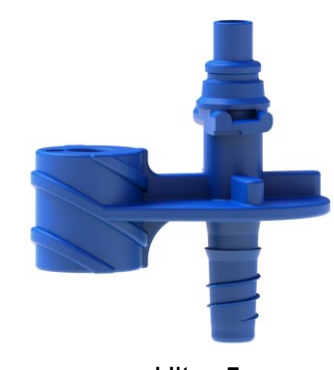
Ultra 5mm threaded nozzle