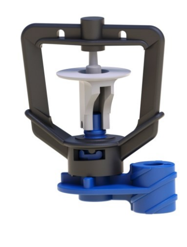
Head with conic female nozzle