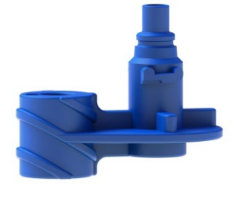
Ultra Conic nozzle