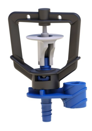
Head with 5mm threaded nozzle