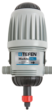
MixRite 2.5 0.8% (11 GPM)