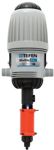
MixRite 2.5 PO (11 GPM)