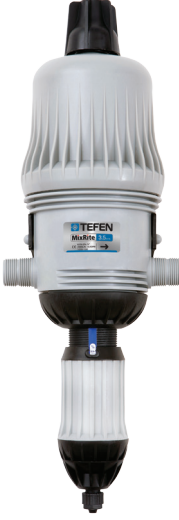
MixRite 3.5 PO (15.5 GPM)