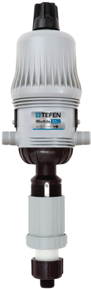
MixRite 3.5 1-10% (15.5 GPM)