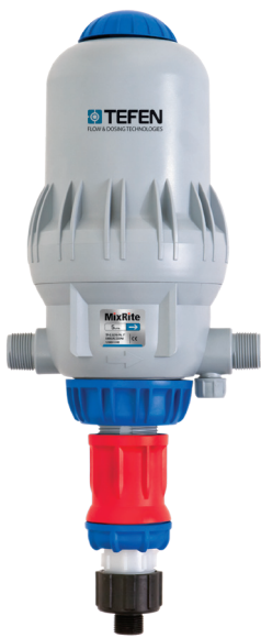
MixRite TF-5 (22 GPM)